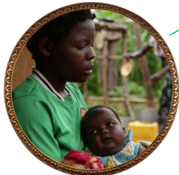
Early Forced Marriage