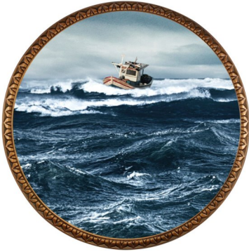
Flight and Rejection