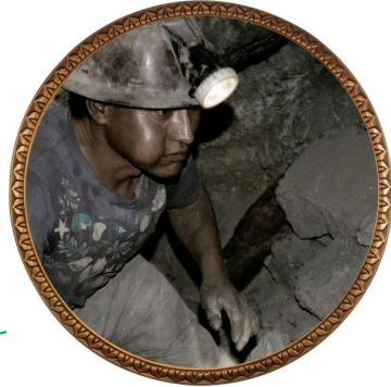
Exploitation of People and Nature